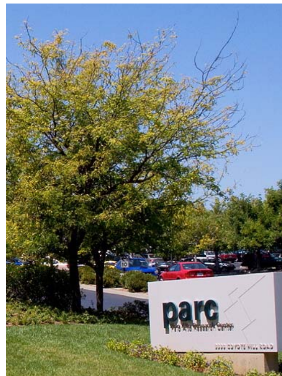
PARC Auditorium, regular venue for the Palo Alto AWIS Chapter Monthly meetings

great role models and mentors. We will also be presenting chapter scholarships. The Palo Alto chapter is proud to be offering three $1000 scholarships to help further the careers of students in science at local community colleges. The Awards Banquet is also an excellent opportunity to network with women from all the Northern California AWIS chapters. We hope that you will be able to join us. Please check http://pa-awis.org for further details shortly.